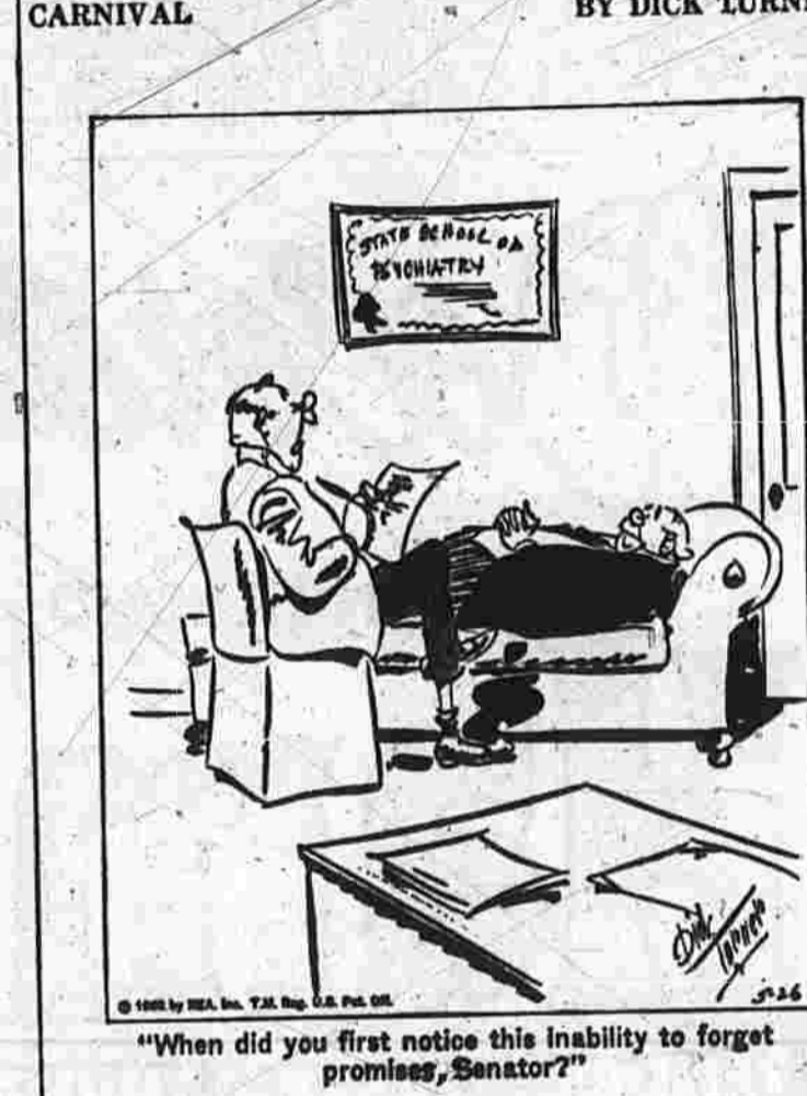
CARNIVAL BY DICK TURNER