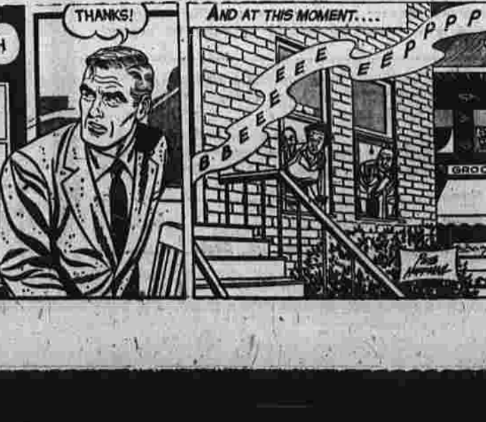
MORTY MEEPLE BY DICK CAVALLI