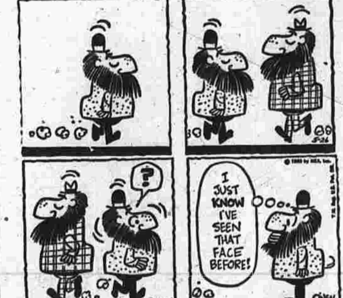
SHORT RIBS BY FRANK O'NEAL