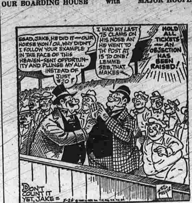
OUR BOARDING HOUSE with MAJOR HOOPLE