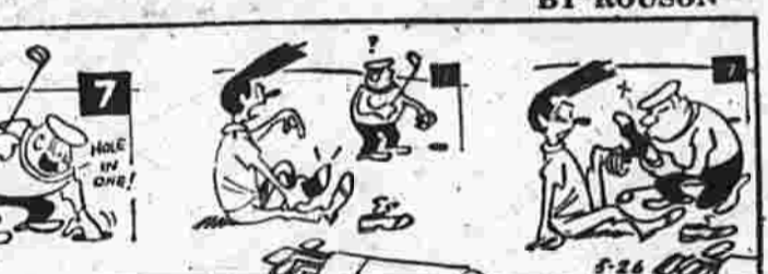
B.C. BY JOHNNY HART